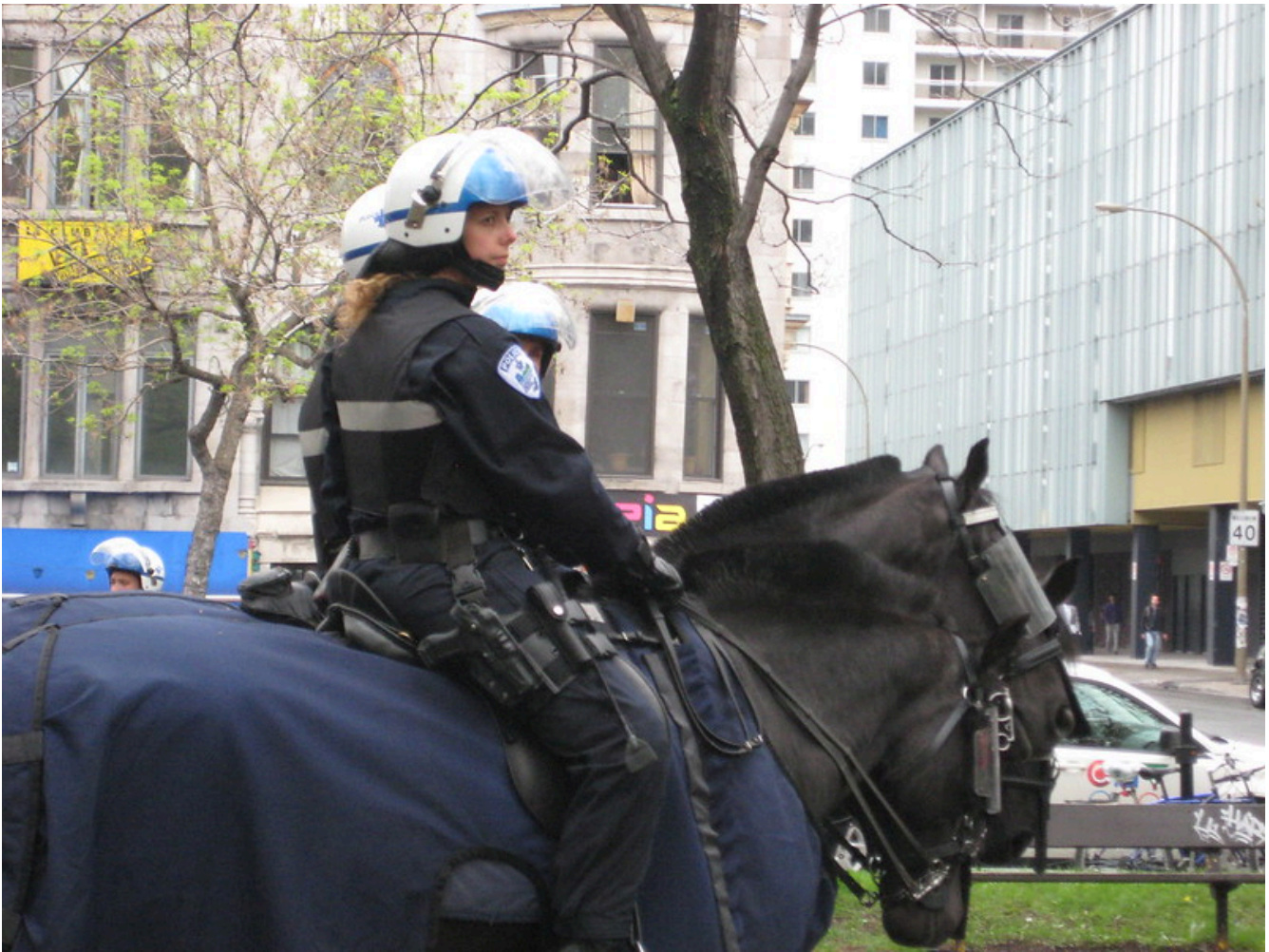
“Alright looking female cop” by Mihnea Stanciu is licensed under CC BY 2.0

Females are less likely to use physical confrontation or demands, and prefer to use verbal communication skills to diffuse a volatile situation. Although there is a shortage of research as to the differences in communication styles between female and male police officers, a small study from Australia does show a consistent difference in strategies between genders. The research showed that the behaviour tactics used by females were more consistent with support, with males employing controlling language such as “come here”. Males also tend to be more “threatening in their approach” and were also in physical contact longer than females. (Braithwaite, 1997, p.280). Citizen behaviour is also different towards male police officers, with verbal and physical abuse being much more frequently used towards males than females (p.281). The conclusion from this study showed that male officers “preferred tactics which emphasised power over the citizen, such as control, threat and physical actions”. It states that: