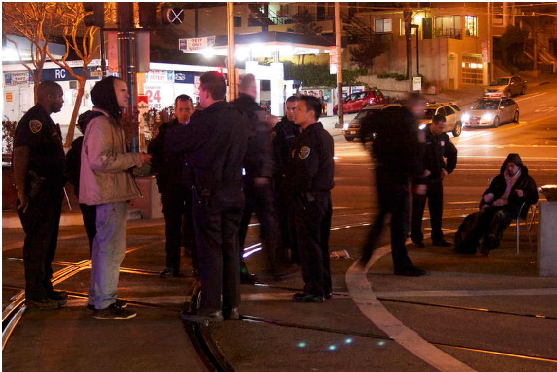
“Talking to Witnesses”

frightened and sees she is placing the contents of her cash drawer into an envelope. The third customer in line remains unaware and is talking on the telephone to his wife about their grocery list. The robber grabs the cash-filled envelope from the teller and turns to run out of the bank. The customer immediately behind him steps out of his way, but he bumps into the third customer still talking to his wife. In this scenario, an investigator could expect to get a detailed account of the events from the bank teller who was engaged in the event and aware of the crime from the outset. The customer immediately behind the robber become aware of the crime and was making observations half way into the robbery. This customer could likely provide some significant details. The third customer in line was never aware that a crime was in progress and, other than perhaps providing a limited description of a man who bumped into him, his value as a witness may be negligible. Many witnesses who make observations of a criminal's activities in the pre-crime stage or in the post crime stage, when they are leaving the scene of the crime, fall into the category of not being aware of the crime. This does not mean these witnesses will be of no value but that their casual observations need to be identified and recorded as soon as possible.