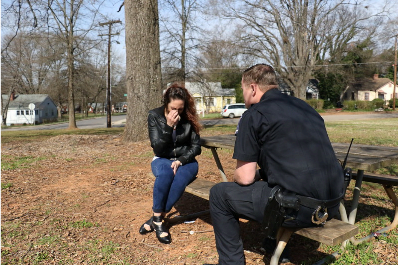
“Crisis Intervention” by Mecklenburg County , Flickr is licensed under CC BY-NC 2.0

understanding that the end result is a resolution without the use of force. Officers must understand that most of their duties are dedicated to keeping the peace, and that a major component of peace-keeping is problem-solving without the use of force (Walker & Katz from Oliva et al (2010).