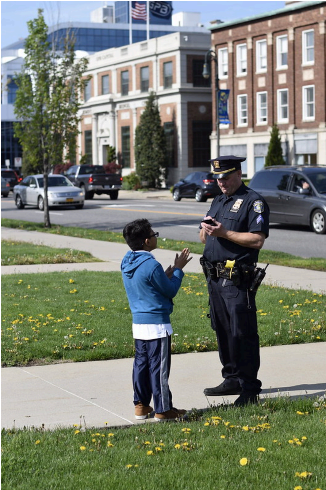
“Kid Talking With Police Officer Looking @ His Phone” by Informed Images is licensed under CC BY-NC 2.0