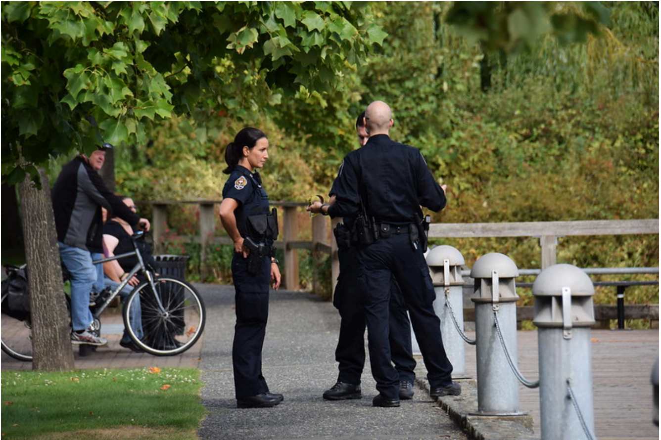
“Barge accident – Victoria Police Department officers at the scene”

At the core of their lengthy training, officers learn how to be respectful whilst prying into people’s lifestyles. Whether they are walking the community sidewalks, answering public enquiries by telephone, or sitting opposite a violent prisoner in an interview room, the officers play a huge part in the investigations. These wide-ranging investigations may include crime, public enquiries, road traffic accidents, missing people, property complaints, civil disagreements or a community issue. Every officer will have a new problem to solve many times a day. As their careers unfold, officers who become good at their job learn the essential skills of effectively communicating, investigating and recording findings.