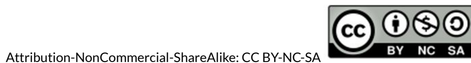
Attribution-NonCommercial-ShareAlike: CC BY-NC-SA

This license lets others remix, tweak, and build upon your work non-commercially, and although their new works must also acknowledge you and be non-commercial, they don't have to license their derivative works on the same terms.