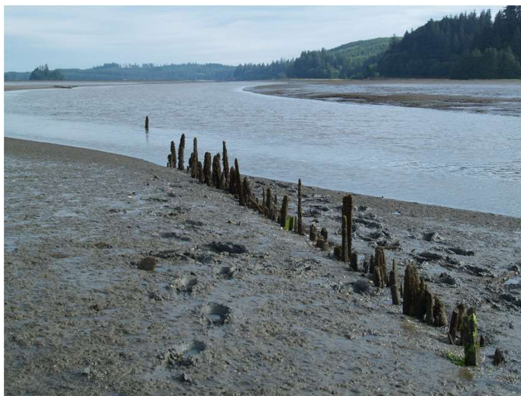
Figure 5 Wooden intertidal fish weir at Bear River, Willapa Bay, Washington. In a functional weir, stakes would run across the river channel. The absence of stakes in the channel in this feature suggests that the trap was dismantled some time in the past. Note footprints next to stakes for scale.

to the ecological benefits of aerating the beach sediments while harvesting clams, people harvesting clams recognize the benefits of returning broken shells and gravels to the beach to keep the sediments productive (Nathan Cardinal and Nicole Smith, pers. comm. to M. Caldwell). Measurements of archaeological clam shells suggest that in some cases only clams of a certain size (age) were collected and that it is possible that clam beds were left fallow to allow populations to reach the harvestable size (Cannon and Burchell 2009). This