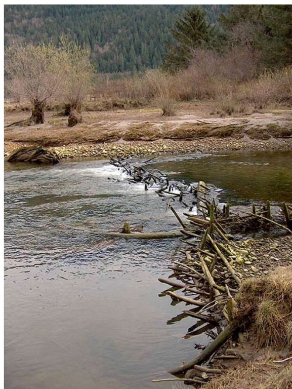
Figure 2 Approximately 200-year-old wooden riverine fish weir in South Bentick Arm, Central Coast, B.C. This was likely used to trap salmon by impeding their movement upstream.