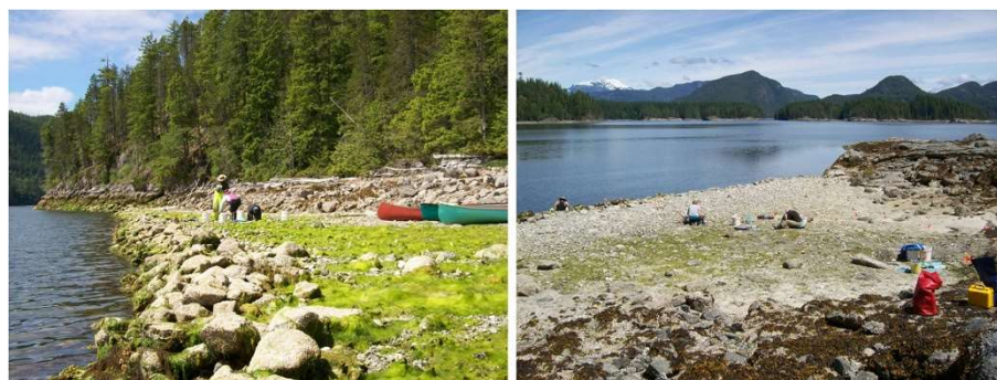
Figure 6 Clam gardens on Quadra Island, B.C. The garden is composed of a rock wall placed at the zero tide line (see wall foreground of left image, and left side of right image), which creates a flat expanse of clam habitat at an ideal tidal height. In these photos, marine ecologist Amy Groesbeck and crew are sampling clams to understand how clam garden modifications affect clam growth and development. (Photos: courtesy of Amy Groesbeck).

On the Northwest Coast, as elsewhere, traditional tenure systems are fundamental to sustained marine resource management (e.g., Johannes 1981, 1982; Haggan et al. 2006; Turner and Jones 2000; Turner 2005). Such systems of ownership were embedded in larger hereditary kin- and status-based social networks (e.g., Powell 2012; Turner et al. 2000; Turner 2005) and regulated the timing and amount of resources extracted. Tenure associated with marine resources was asserted through the ownership of fish harvesting locations (e.g. streams, dip netting rocks, fish traps/weirs, coves), the rights to catch fish from specific locations (Turner and Jones 2000),