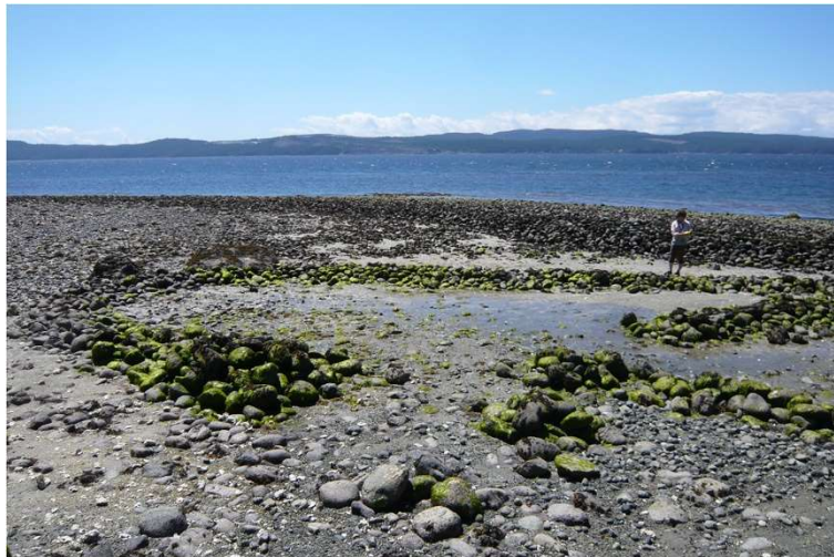
Figure 4 Hook-shaped stone intertidal fish trap near Powell River, B.C. that functioned by funneling and then trapping fish, such as herring and perch, in through the wall openings during a receding tide. Water held by the walls through the tidal sequence may have extended harvesting times.

to their spawning grounds further upriver (Langdon 2006b). Additionally, the Tlingit would rearrange rocks to improve stream flow and increase salmon spawning habitat; these same “streamscaping” actions would also improve visibility for salmon gaffing (Langdon 2006b). Notably, none of these behaviors will be detectable in the archaeological record.