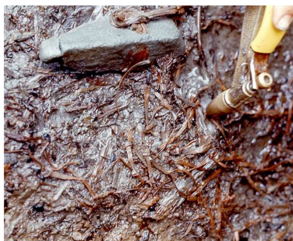
Figure 3 Remains of an approximately 2,800-year-old gill net recovered from the Hoko River site (45CA213) in Washington. The net is made of mono-filament Sitka spruce limb splints and tied with non-slip square knots placed approximately 5 cm apart. The net was recovered with an attached anchor stone, indicating that it was likely used for fishing (Croes 1995). Prior to its recovery, Washington State Fish and Wildlife Department lawyers argued in American Indian fishing rights court that Europeans introduced net fishing to the Northwest Coast.

sometimes provide information on the harvest of taxa that are rarely preserved in archaeological contexts (e.g., Pacific octopus [ Enteroctopus dofleini ] and sea cucumbers [ Parastichopus californicus ]).